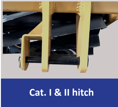
Cat. I & II hitch